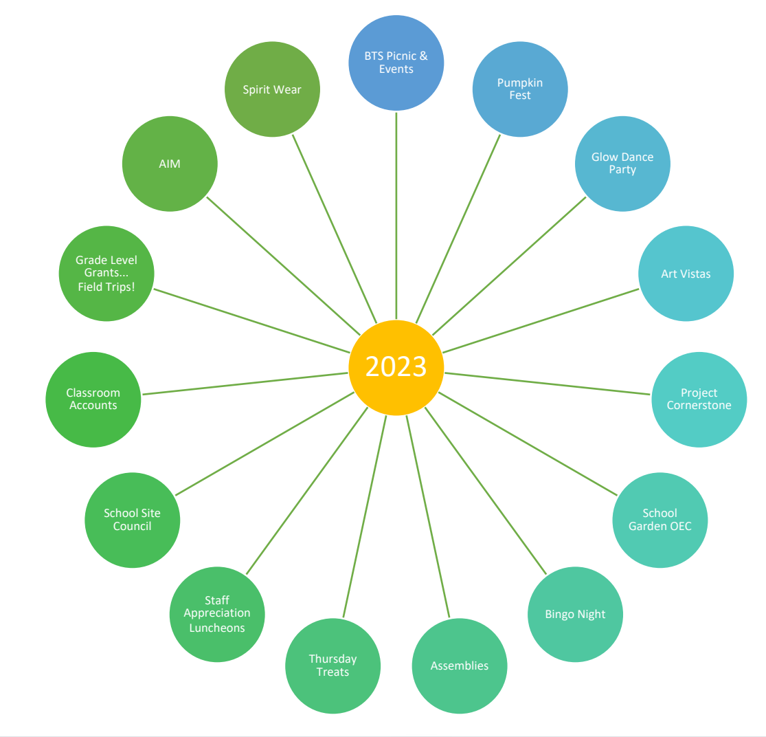
Thank you to our amazing ML community for all we've been able to do in 2023 so far!

Want to Donate or Get Corporate Match In? Scan QR code or visit <u>MLEF here</u>!